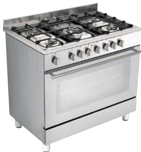
90CM S/S FREESTANDING OVEN MARK FREE STAINLESS STEEL CHILD SAFE COOL-TOUCH DOOR 5 BURNER-CAST IRON TRIVETS UNDER KNOB IGNITION