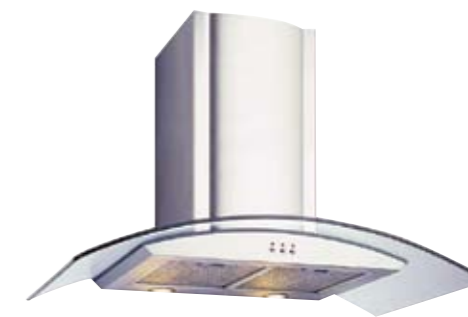
90CM S/S CURVED GLASS CANOPY 520M /HR AIR MOVEMENT TWIN HALOGEN LIGHTS DISHWASHER SAFE FILTERS