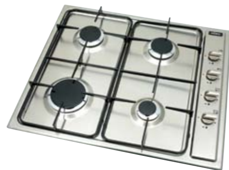
60CM S/S GAS COOKTOP UNDER KNOB IGNITION ENAMEL TRIVETS SINGLE PIECE SS MOULDING

Better yet, Strata Kitchens offers the Milano range at Internet prices and delivered directly to your front door. View the full range online.