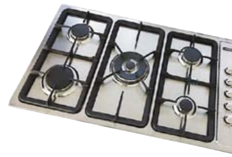
90CM S/S GAS COOKTOP 5 BURNERS CAST IRON TRIVETS SINGLE PIECE SS MOULDING