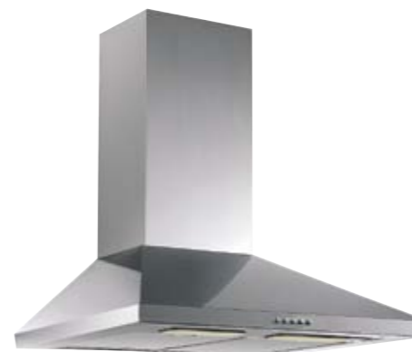
60CM S/S CANOPY RANGEHOOD 520M /HR AIR MOVEMENT TWIN HALOGEN LIGHTS DISHWASHER SAFE FILTERS 3 SPEED SETTINGS