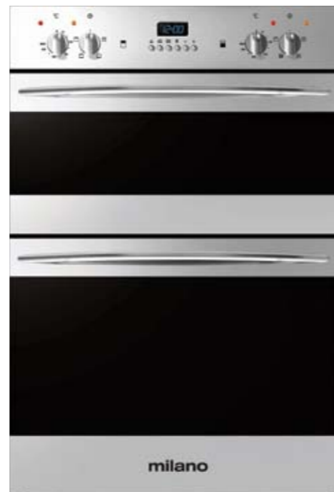
60CM DOUBLE WALL OVEN MARK FREE STAINLESS STEEL CHILD SAFE COOL-TOUCH DOOR PROGRAMMABLE DIGITAL CLOCK 10 COOKING FUNCTIONS