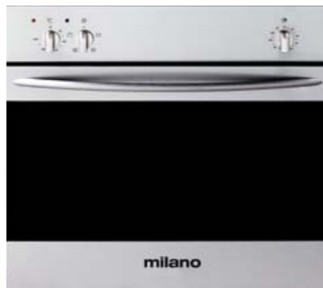
60CM S/S FAN FORCED OVEN MARK FREE STAINLESS STEEL 61L CAPACITY CHILD SAFE COOL-TOUCH DOOR 4 COOKING FUNCTIONS