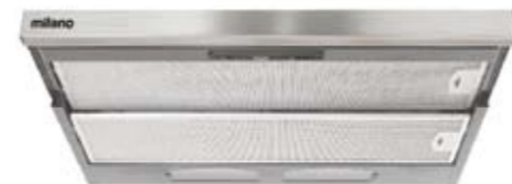
60CM S/S SLIDEOUT RANGEHOOD 250M /HR AIR MOVEMENT TWIN INCANDESCENT LIGHTS DISHWASHER SAFE FILTERS 3 SPEED SETTINGS