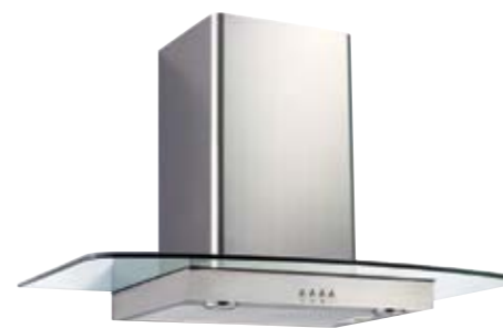
90CM S/S FLAT GLASS CANOPY 520M /HR AIR MOVEMENT TWIN HALOGEN LIGHTS DISHWASHER SAFE FILTERS 3 SPEED SETTINGS