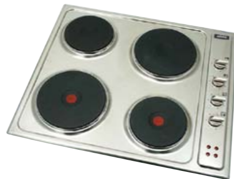
60CM ELECTRIC COOKTOP RESIDUAL HEAT INDICATORS SINGLE PIECE SS MOULDING