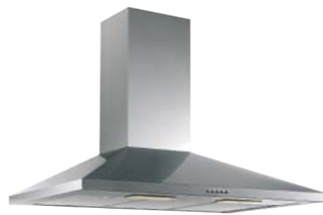
90CM S/S CANOPY RANGEHOOD 520M /HR AIR MOVEMENT TWIN HALOGEN LIGHTS DISHWASHER SAFE FILTERS 3 SPEED SETTINGS